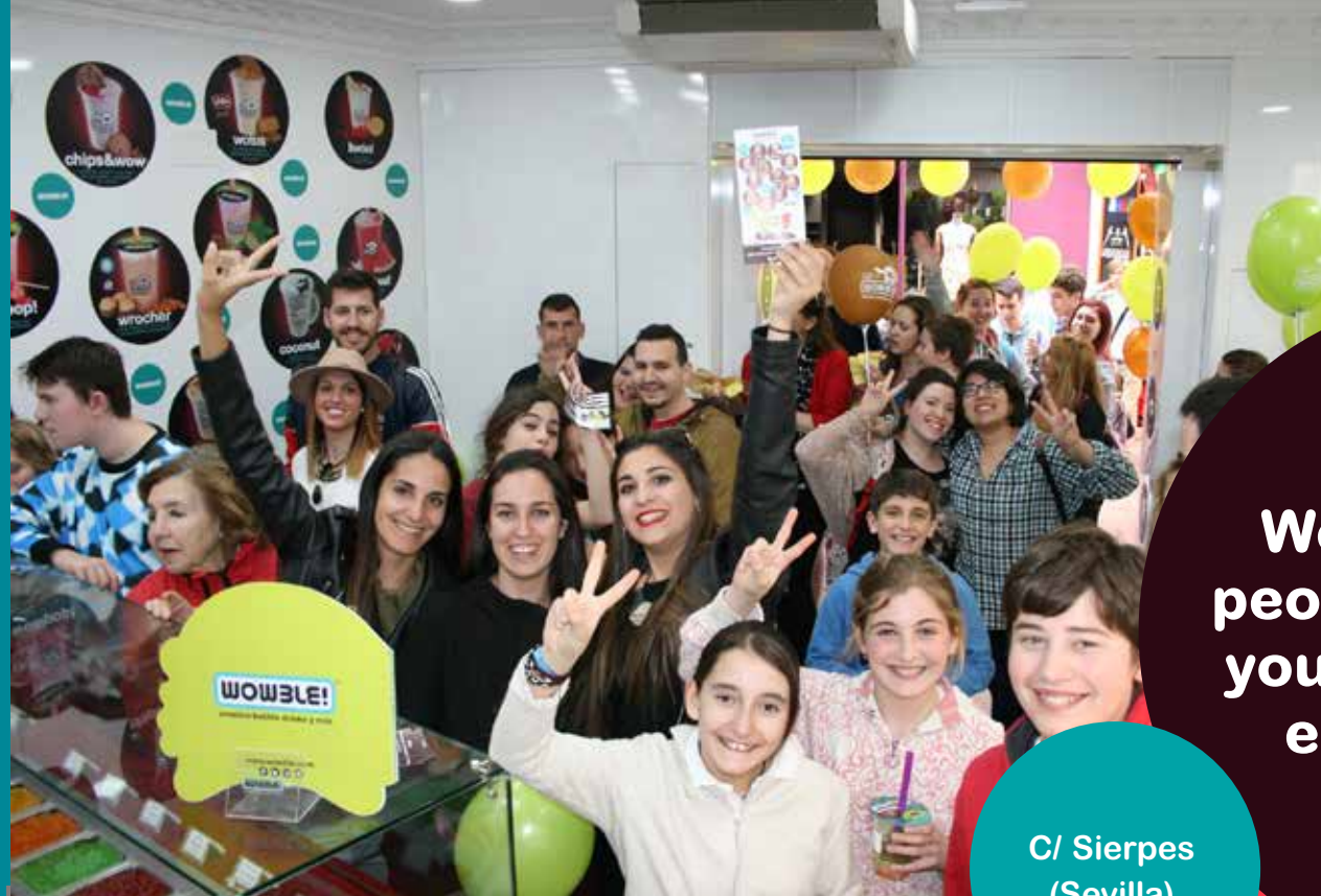
C/ Sierpes (Sevilla)