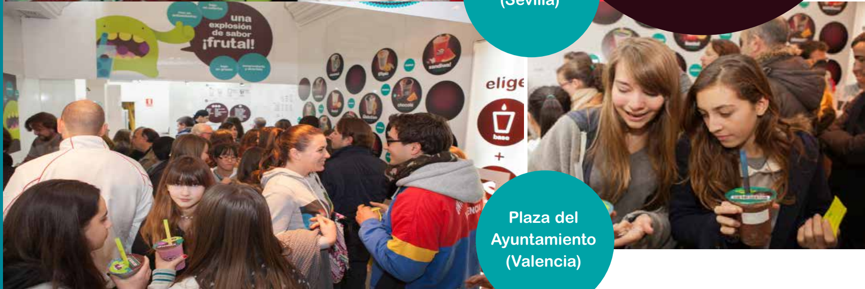
Plaza del Ayuntamiento (Valencia)